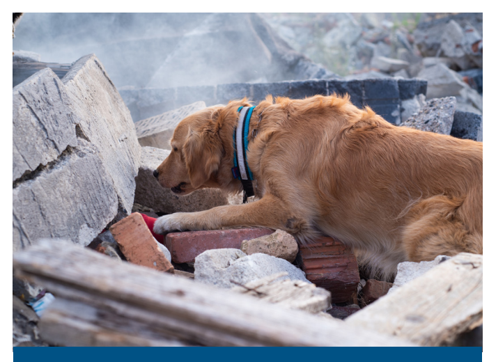
If where you are isn't safe for you, it isn't safe for your animals.