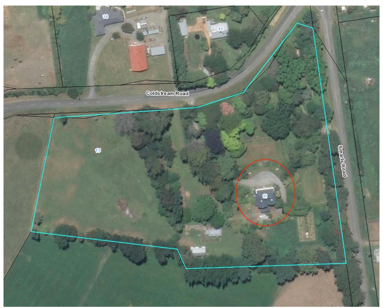
Extent of scheduling, limited to the immediate garden setting, 'Coldstream', 11 Coldstream Road, Ashley, Rangiora.