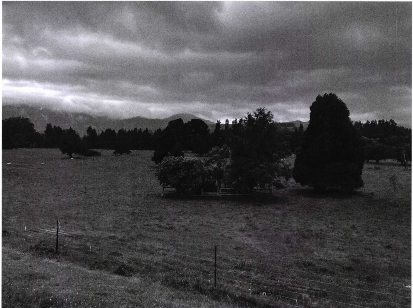
Photo three: View across contested land, left side. Gives you an idea of what the farm land looks like.

If you would like further information or documentation about the trees on this piece of land I can easily arrange that for you.