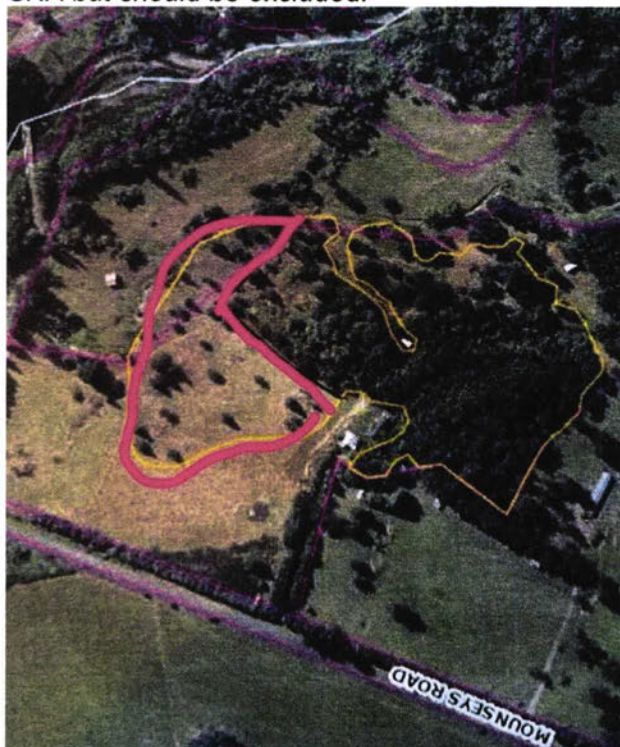
Image one: Red outline drawn around that area of land that is currently included in proposed SNA but should be excluded.

Where I draw issue with the proposed changes is the addition of land that has previously not been included in the SNA and does not have any real link to the protected area. This area of land is in the left section of the proposed SNA (see Image one below) and is made up of grassland with a few scattered trees. The trees in this area are (with the exception of three beech trees) all introduced species, there is no wetland in this area and no areas in which native fauna reside. This is an area which I currently use for farming and I feel that for it to be included in the SNA is both unnecessary and unfair as It would deprive me of a large section of my farmable land.