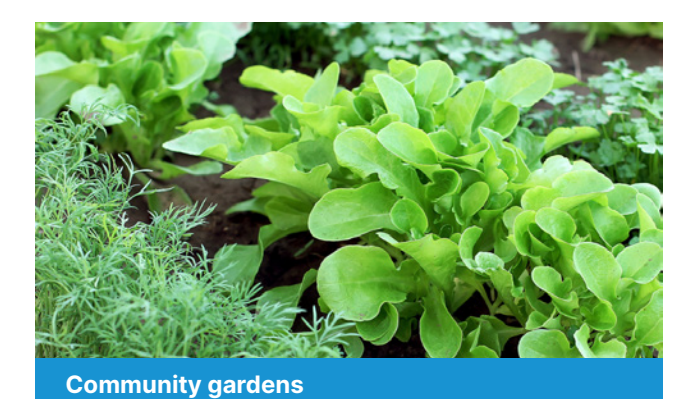
The Board, therefore, requested the Council to actively support food security initiatives by providing initial funding through the

establishment phase of suitable spaces for the location of Food Forests and community gardens in the Rangiora-Ashley Ward.