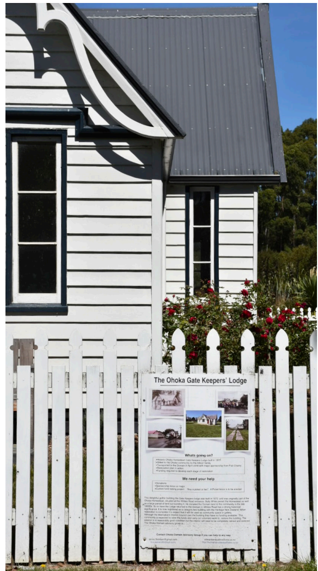
Ohoka Gate Keeper's Lodge

The Board has also requested staff to investigate options for dog agility equipment for the Oxford Dog Park.