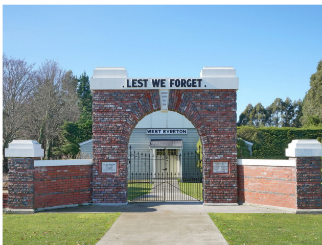
West Eyreton Hall