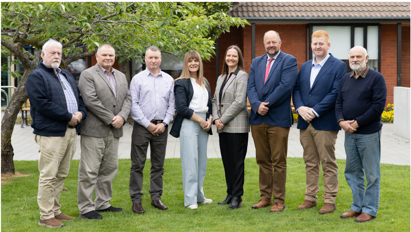
Oxford-Ohoka Community Board Members

(For the Chair's report to Council on the Board's work for 2025 please see Appendix 1).