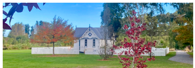
Ohoka Domain with Gate Keepers Lodge

waimakariri.govt.nz/leisure-and-recreation/facilities/wdc-halls-and-meeting-venues