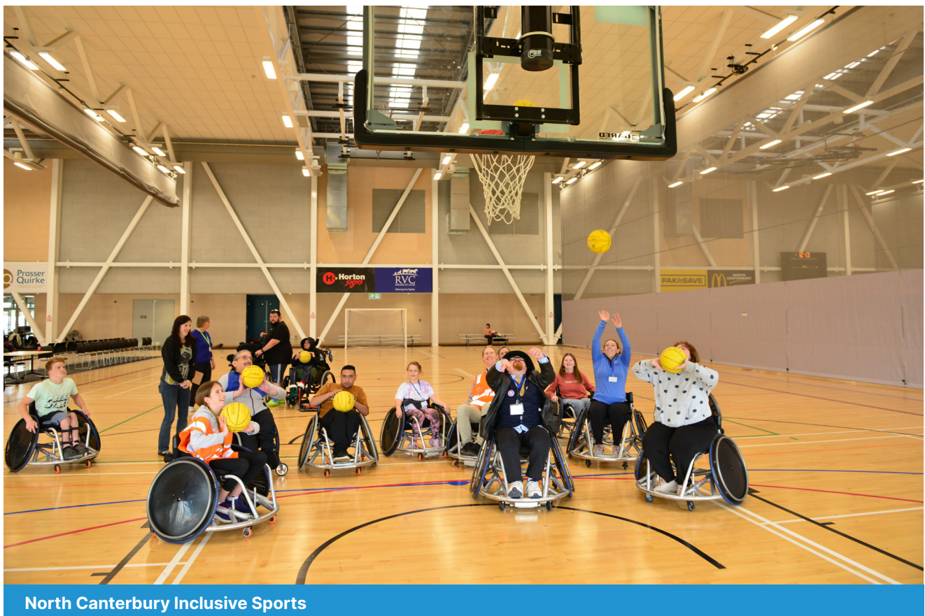
North Canterbury Inclusive Sports