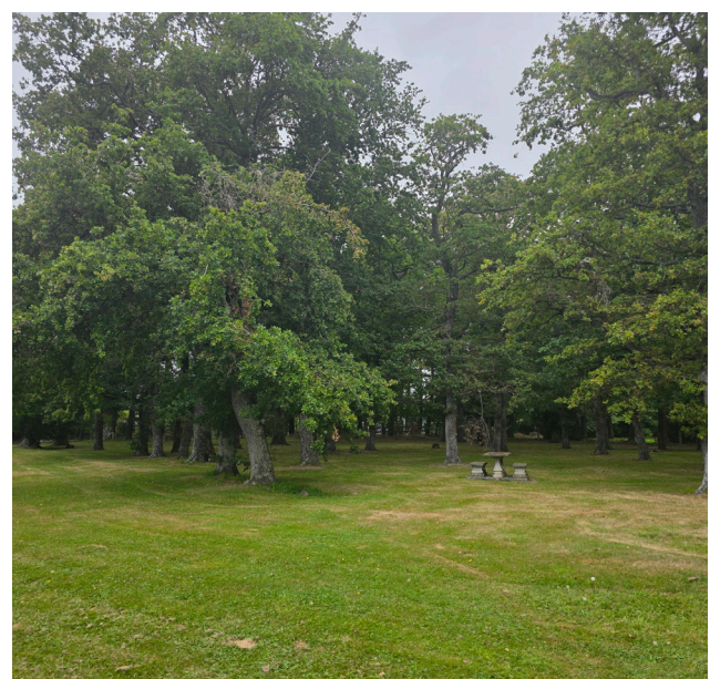
Oxford Dog Park