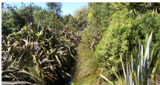
Native planting along stream