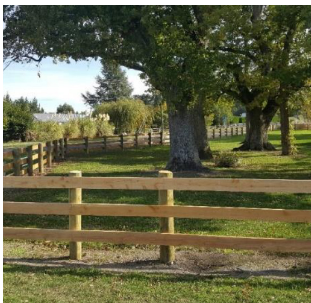
Oak Reserve – West Eyreton