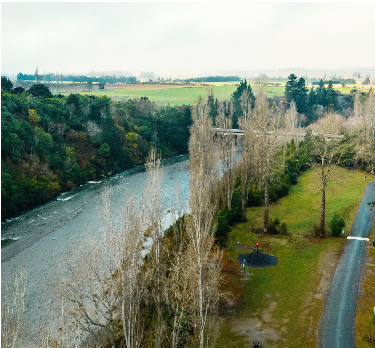
Ashley Gorge Reserve

or dropped into your local Council Service Centre (see back page for details).