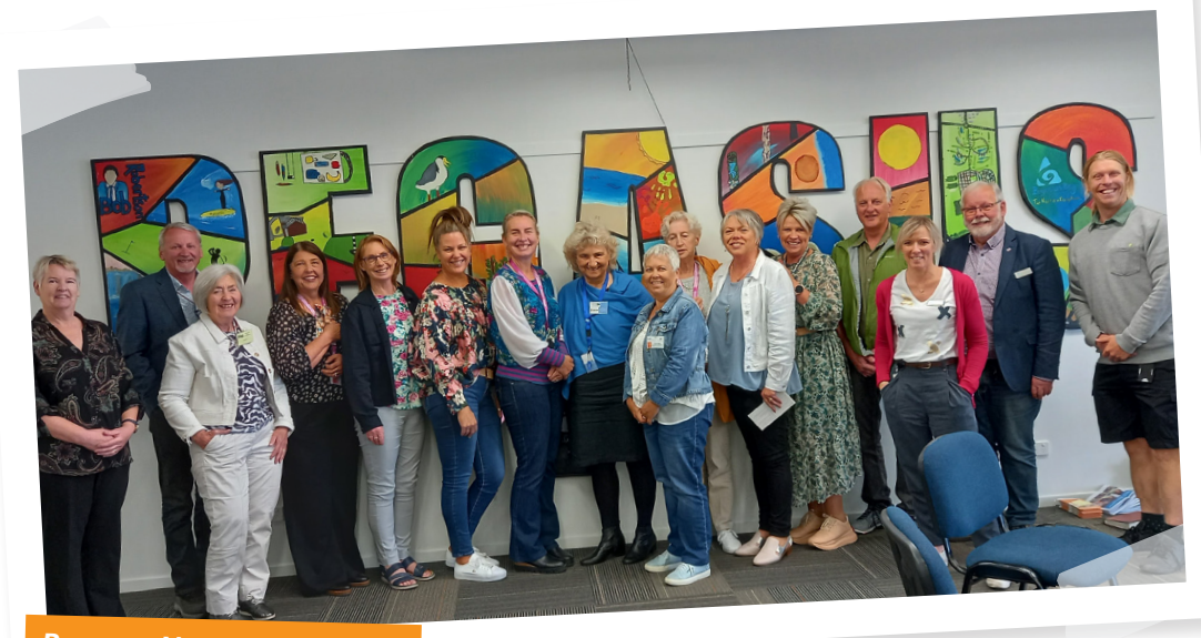
Pegasus Networking forum