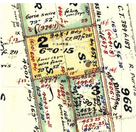
Detail of DP 10700, dated 3 October 1935, showing the kiln. LINZ