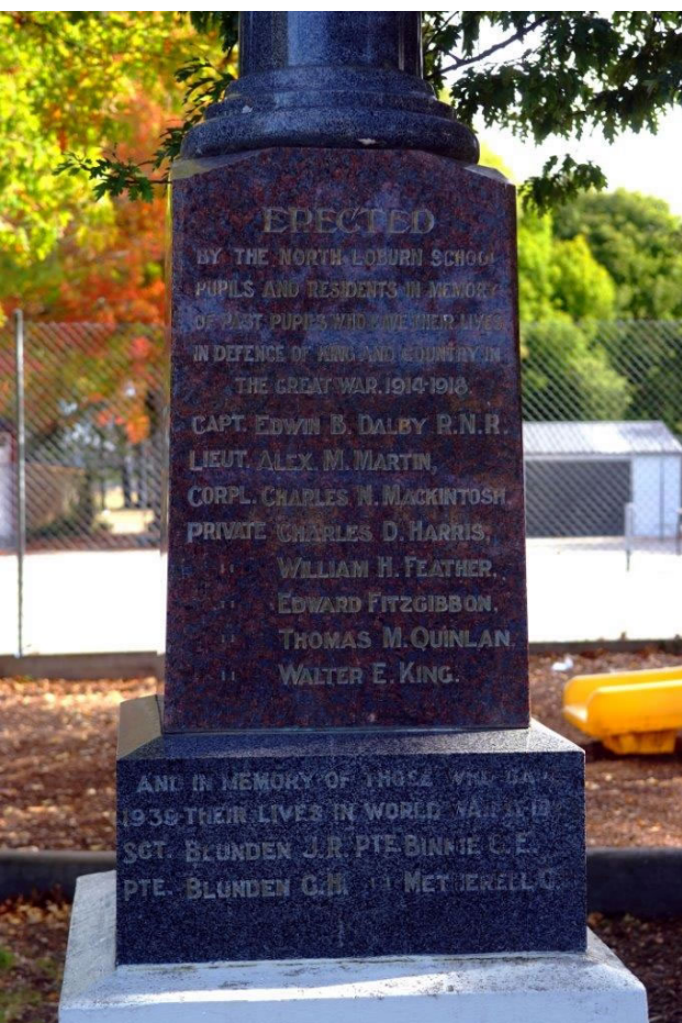
Star 24 March 1919, p. 4.