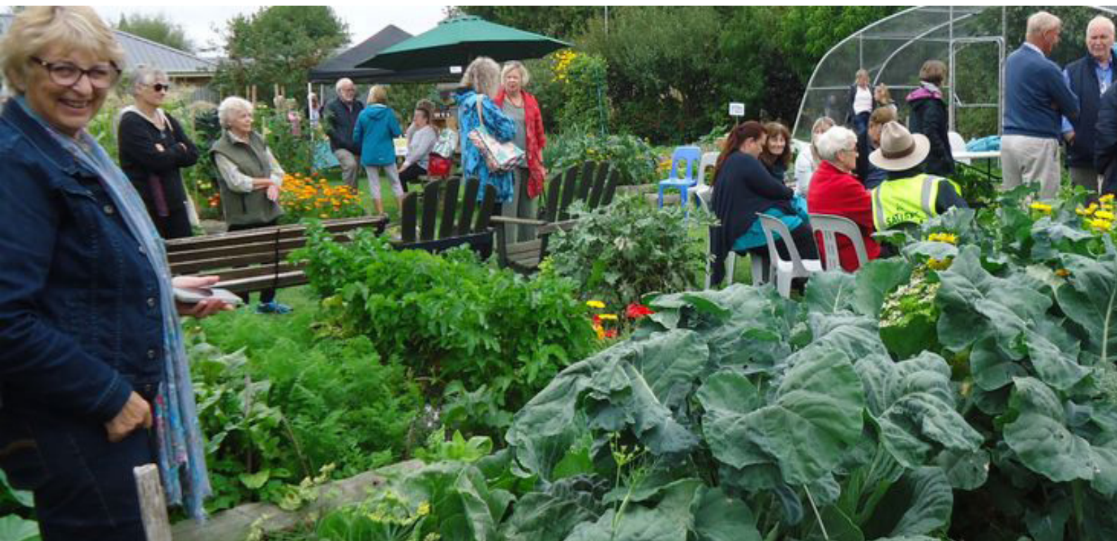
10-year Celebration - Kaiapoi Community Garden