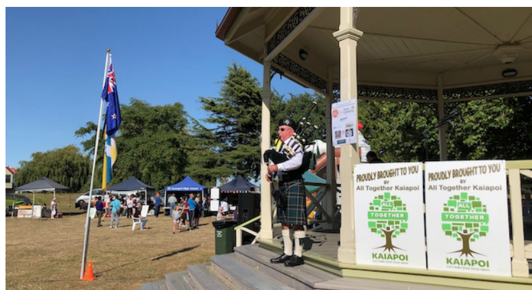
Waitangi Day Celebration - All Together Kaiapoi

Or dropped in to your local Council service centre (see back page for details).