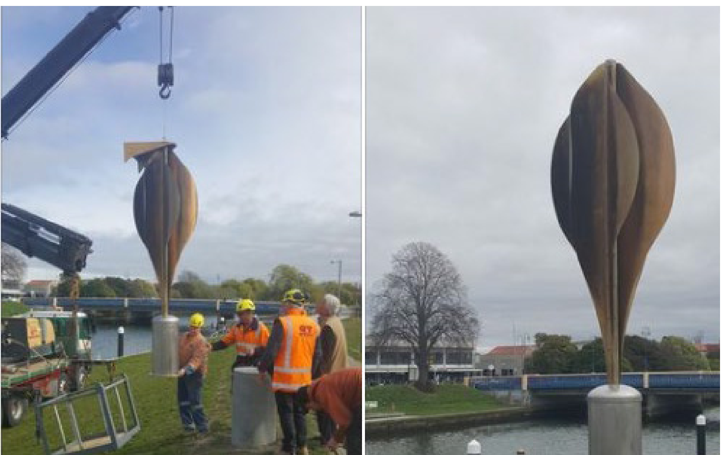
Blackwells Department Store 150 celebration sculpture