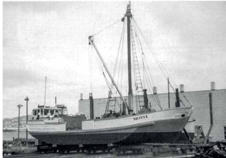
The scow Success at an earlier stage in its life

The Board will be working in partnership with the Trust to store and restore the historic scow "Success" at the Corcoran Reserve at 73 Charles Street. A temporary lease has been approved. Once restored, it is envisioned that the Success could be used as a tourist attraction taking visitors down the river.