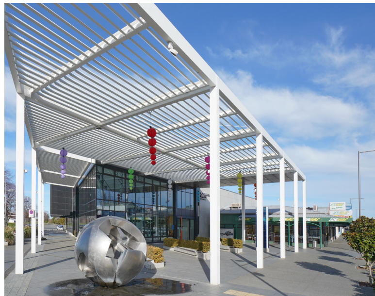
Kaiapoi Service Centre