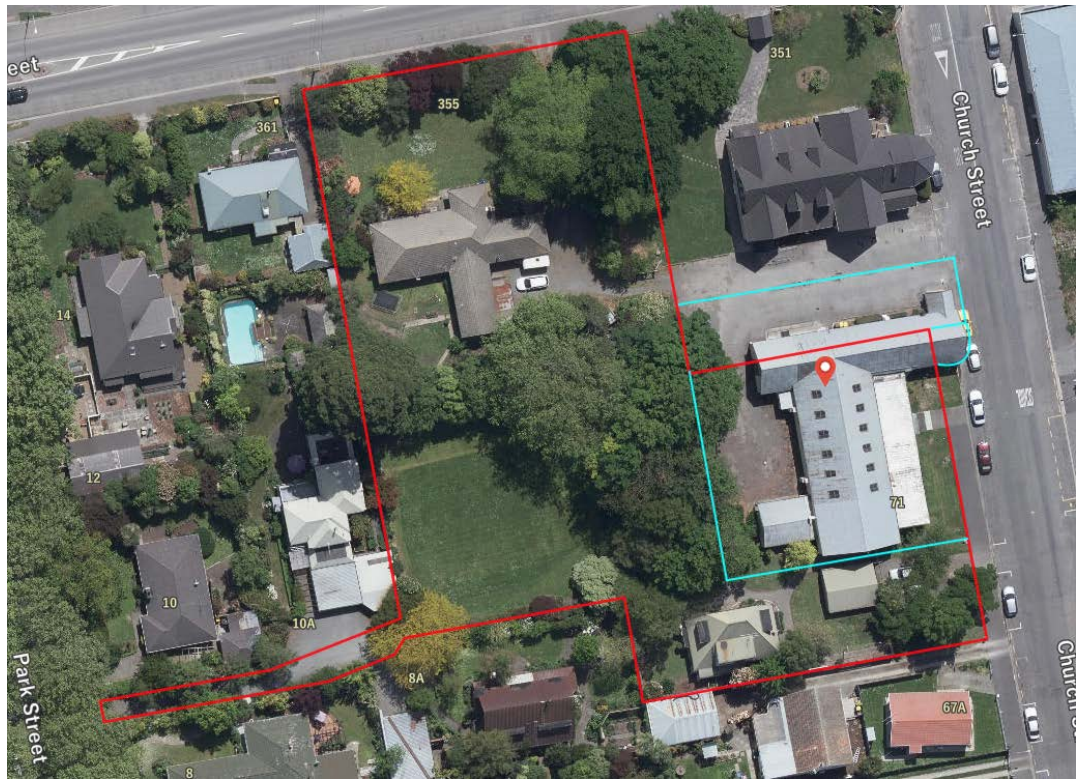
Extent of setting, limited to immediate environs and noting that the south-east corner of the building extends over in to the road reserve, Church of St John the Baptist Sunday School & Parish Hall, 71 Church Street, Rangiora.