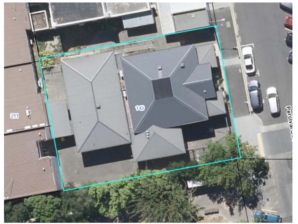
Extent of setting, former Rangiora Courthouse, 143 Percival Street, Rangiora.