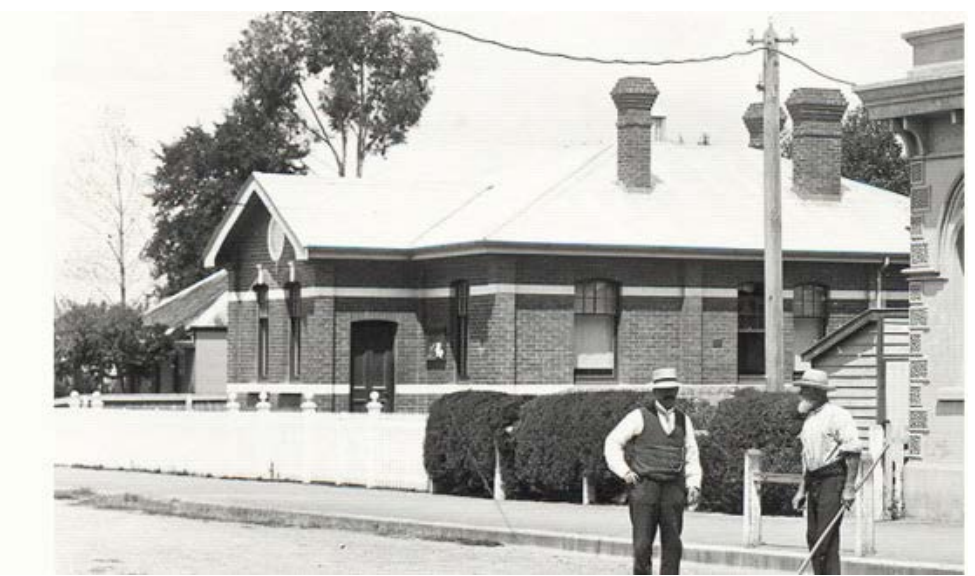
As built. www.