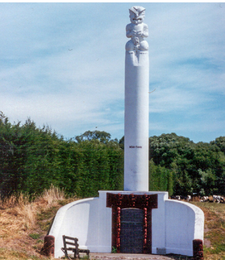
Kaiapoi Pā Monument (historical image)