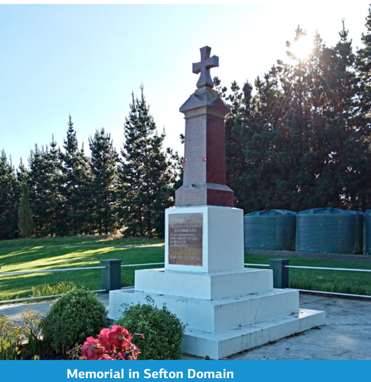
Memorial in Sefton Domain

The Governance Team will notify you following the meeting of the Board's decision.