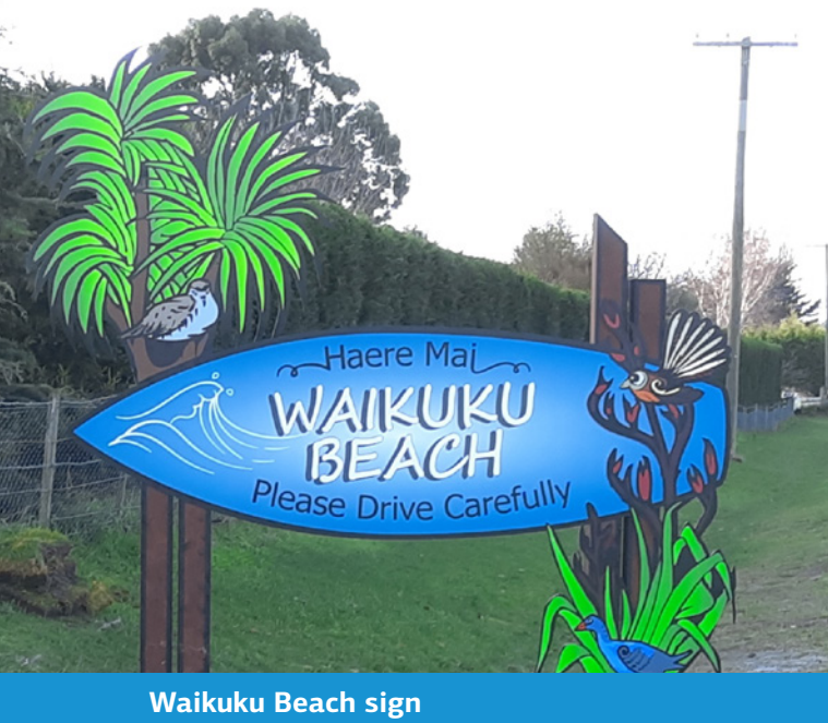
Waikuku Beach sign