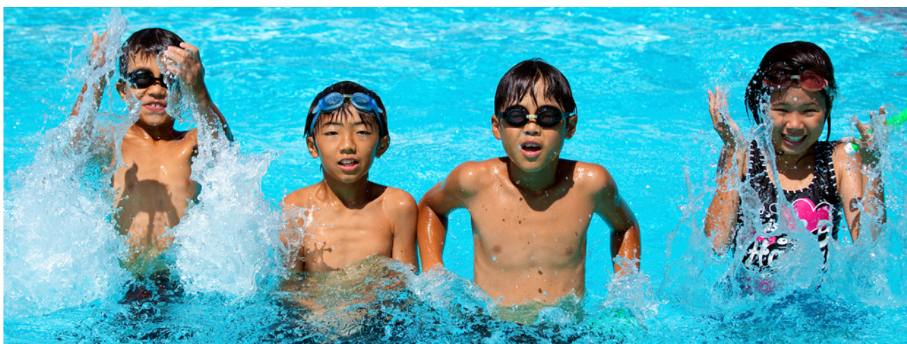
Sefton School Swimming Pool