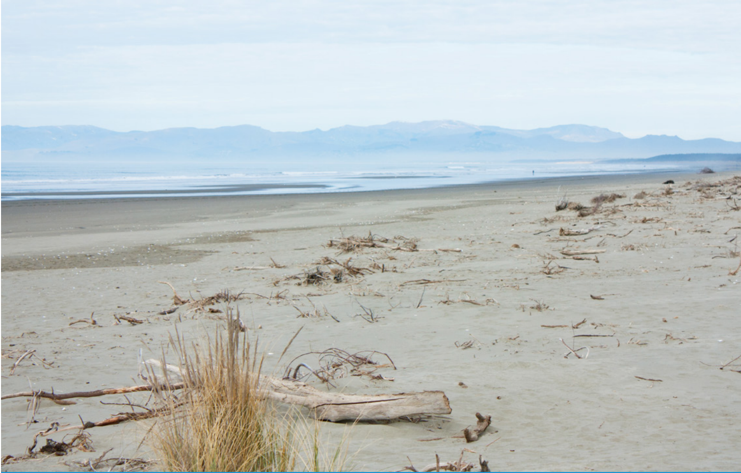
Pegasus Bay Beach