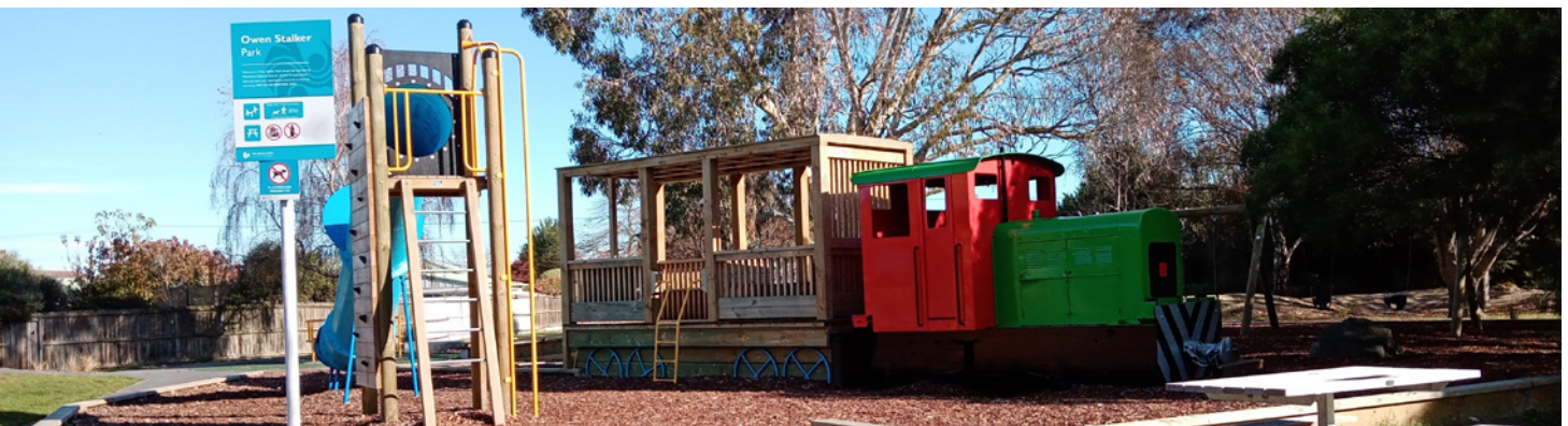
Owen Stalker Park