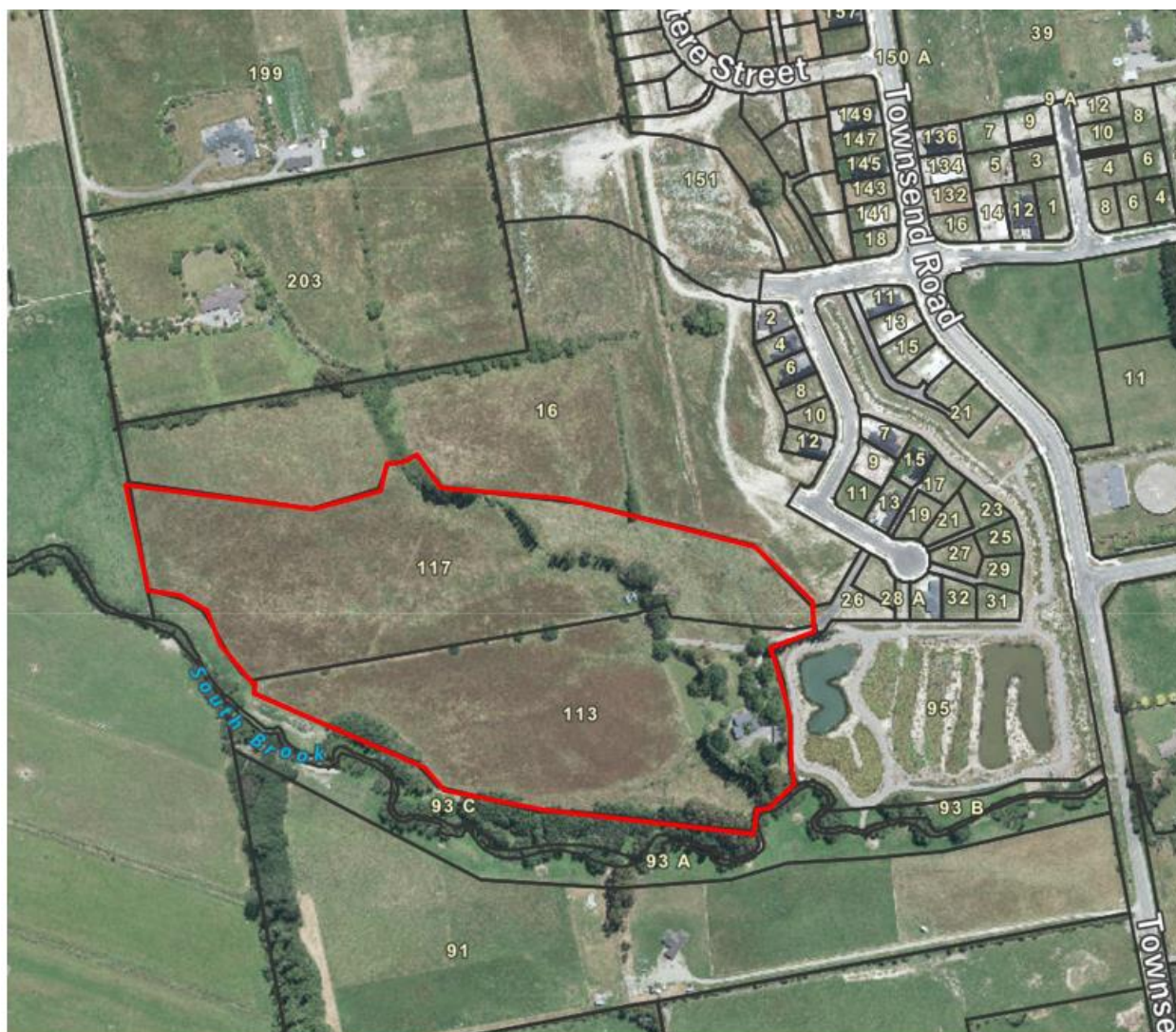
Figure 1: Site subject to the submission

update to the relief sought, this submission should be read alongside and subject to that earlier submission.