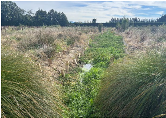
Carex secta plantings