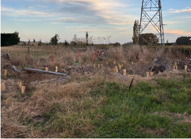
Extension to wetlands, 8 trees removed.