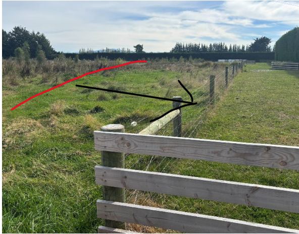
Ketchum Cottage Wetlands extension 1/3 fences moved out.