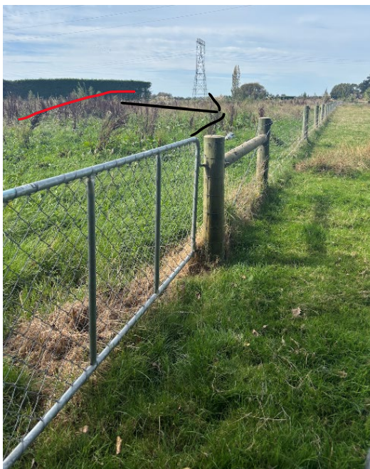
2/3 fences moved, 2x access gates added,