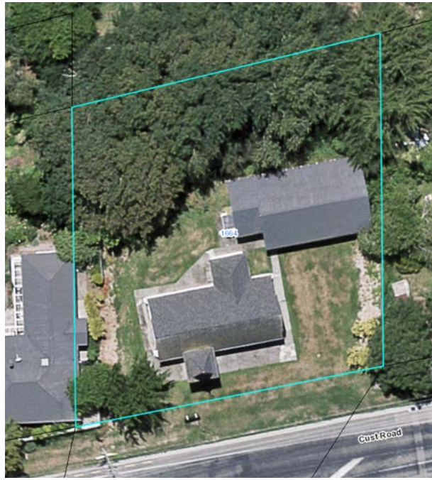
Extent of setting, 1664 Cust Road, Cust.