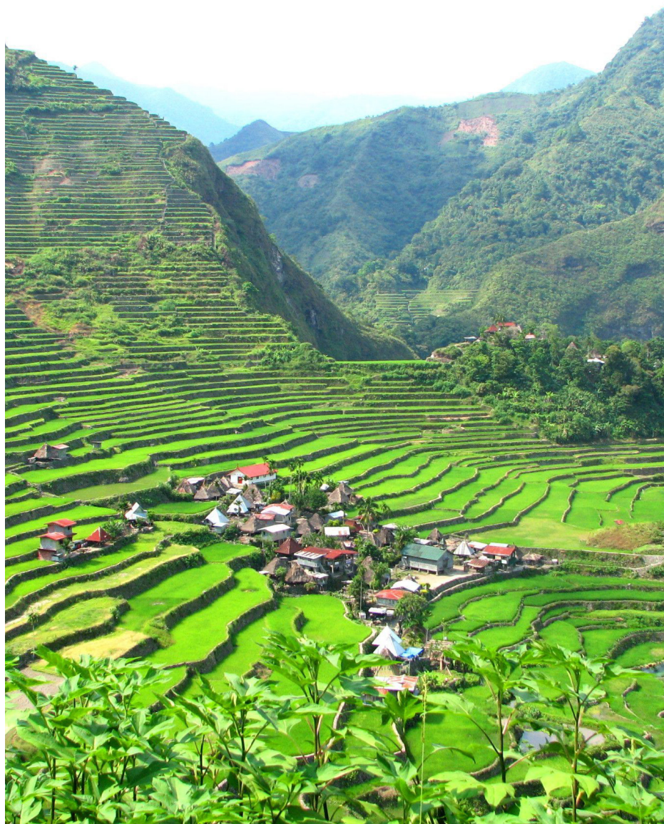
Village and Rice Terraces in the Philippines