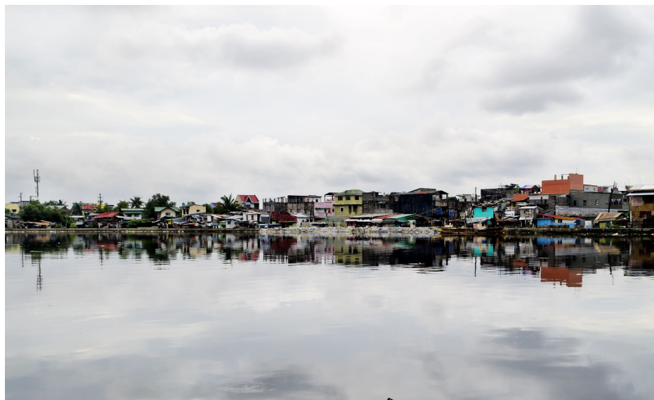
Houses along the Malabon River