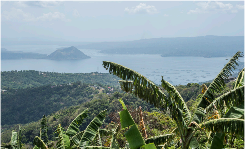
The Province of Batangas

17 regions (16 administrative and one autonomous). Southern Tagalog was the largest region in the Philippines in terms of both land area and population. The 2000 Census of Population and Housing showed the region having a total of 11,793,655 people, which comprised 15.42 % of the population of the country.