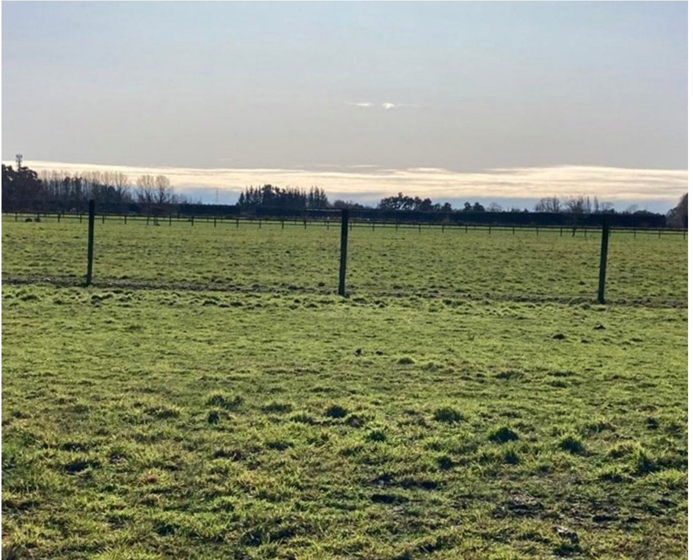
Photo 2 and 3 - Our property at 800 Tram Road