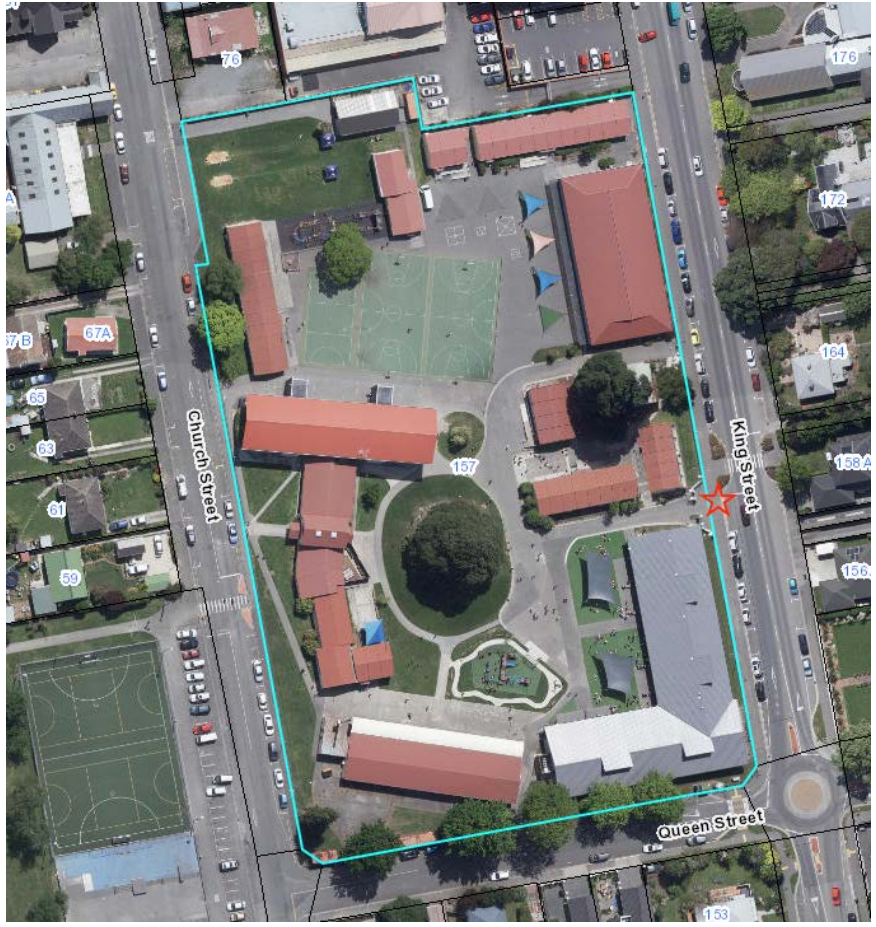
Land parcel as a whole with gates marked by star.