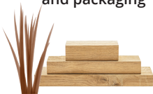
Timber off-cuts, flax, cabbage tree and stringy plants.