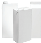
Empty liquid/long-life drink cartons like soy or almond milk, stock, yoghurt or custard