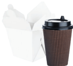
Takeaway cups, compostable and biodegradable bags and packaging