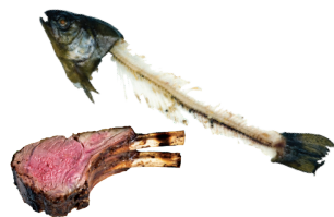
Food scraps including meat, bones and fish