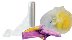
Scrunchable plastics like bubble wrap, biscuit trays, food packets, shopping bags and cling film