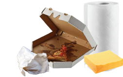
Food soiled cardboard and paper, paper towels and serviettes