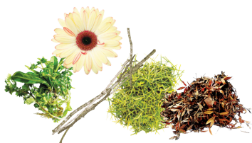
Garden waste (but not flax, cabbage tree leaves, soil or other stringy plants)