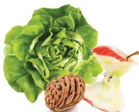
Fruit and vegetables