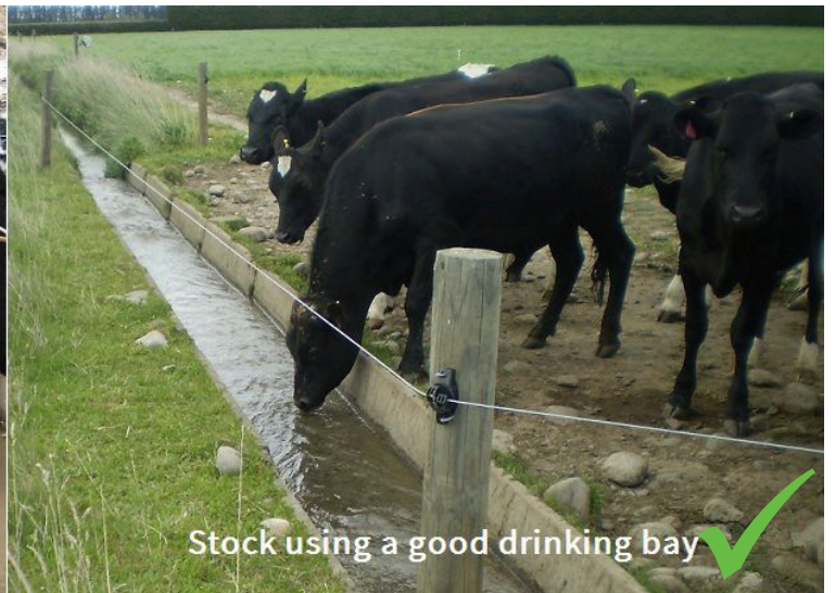
Stock using a good drinking bay