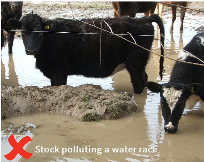
Stock polluting a water race

Water races can become polluted from stock and other farming activities. Appropriate stock access improves water quality for your stock, downstream water users, and freshwater biodiversity.