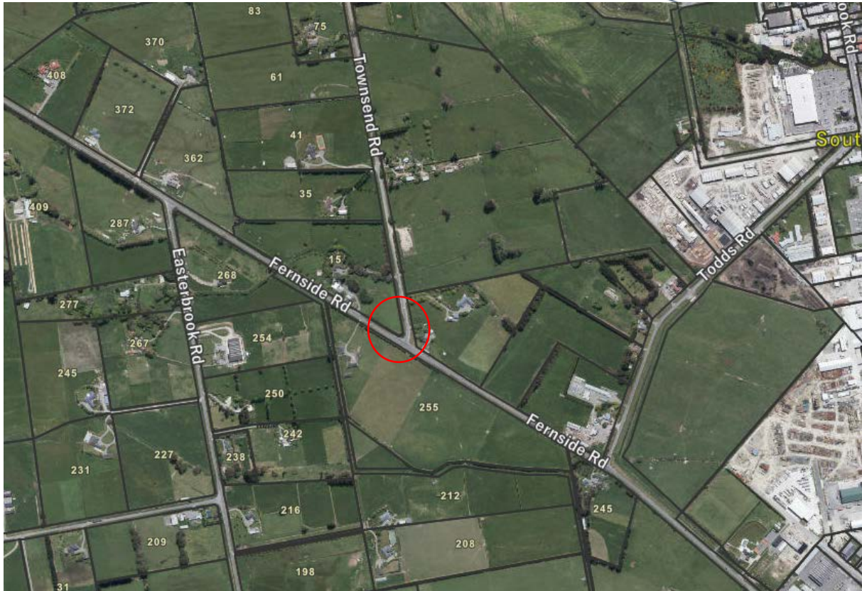
Figure 1: General site location