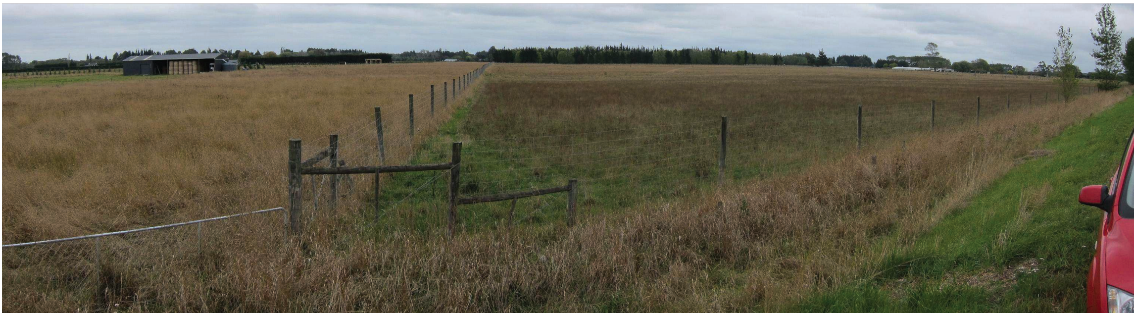
Photograph B: View across the site and the adjacent land to the southeast from Main Drain Road as it follows the top of the Cust River stopbank adjacent to the site's southeastern boundary.