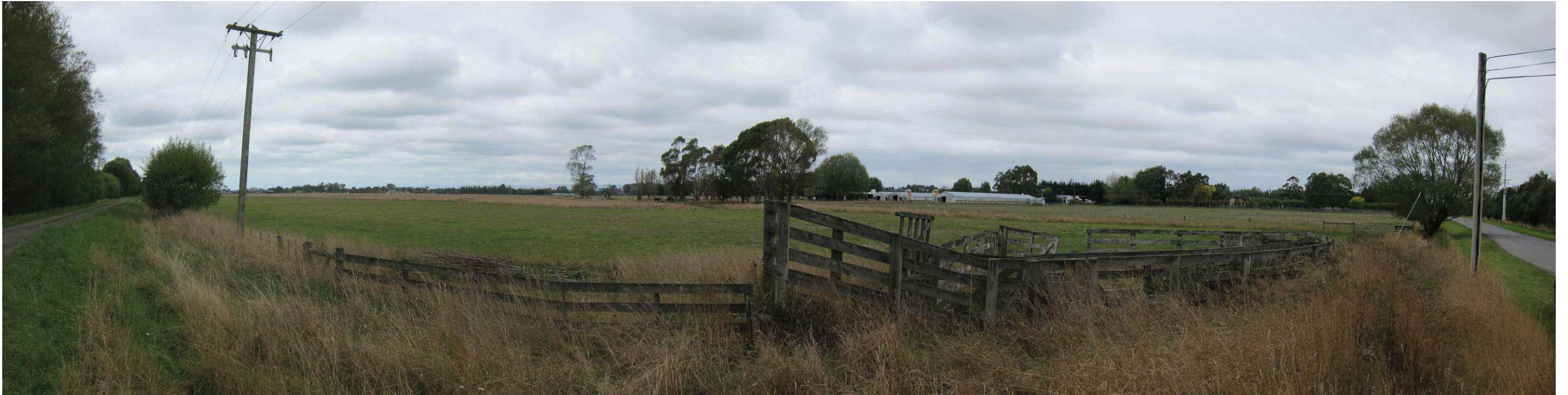
Photograph A: View across the Bagrie farm from the corner of Main Drain and Bradleys Road. The established trees and chicken farm buildings of the current farming operation can be seen in the mid ground.

Note that all photographs are taken with a digital camera with a focal length that is the equivalent of 50mm. They are intended to illustrate points made in the Landscape Effects Assessment Report and not to exactly simulate the field of view that is taken in by the human eye.