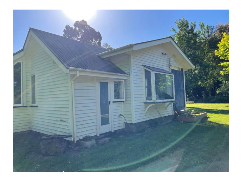
Dwelling 1 – original dwelling