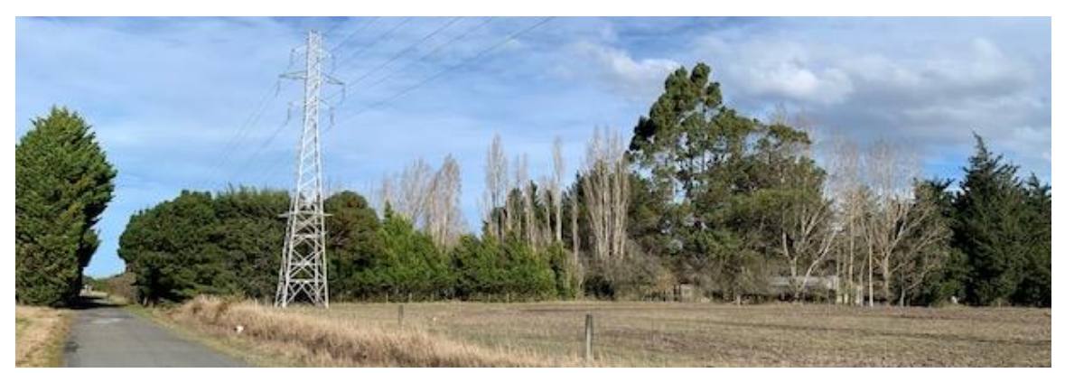
Conifers within the road reserve on the left (north) of Paisley Road and vegetation within the site shown on the right (south) of Paisley Road under the overhead power lines. Dwelling 1 is located behind the vegetation directly behind the lattice tower.