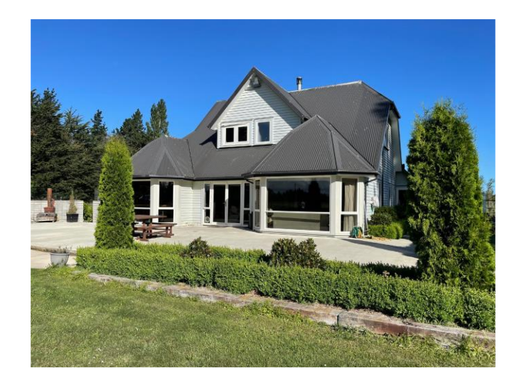
Dwelling 2 - relocated to site post-earthquakes